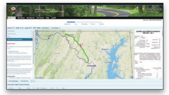
Permit requests automatically trigger accurate, up-to-date data searches to determine which route for an OS/OW vehicle will have the least impact on the infrastructure.

To eliminate these costly delays, MDSHA had to make the permitting process fast, easy to navigate, and accurate. A statewide online system would remove the administrative roadblocks and enable carriers to obtain hauling permits in a secure, user-friendly environment. MDSHA launched the