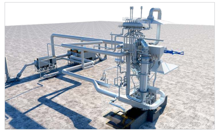
Construction simulation in SYNCHRO ensured the steelmaking plant's complex structural arrangement was constructed safely and quickly to save CNY 1.8 million.

Using Bentley applications, WISDRI saved 300 hours of communication time to lift design efficiency by 30% and cut design time by 45 days. The digital solutions supported simultaneous engineering work among 15 separate design disciplines to avoid 166 major collision points on the Quwo steel plant. Moreover, simulating construction in SYNCHRO removed 60 days from the construction timeline to save CNY 1.8 million on the project. Most importantly to the client, using the modeling software to quantify carbon dioxide release lowered the plant's carbon emissions by 0.1 ton per every ton of steel to achieve the energy conservation requirements on this project. Conquering so many obstacles and building a cost-efficient, sustainable steel plant that contains intelligent, cutting-edge technology, WSIDRI is now a new leader in applying digital solutions in the metallurgical field.